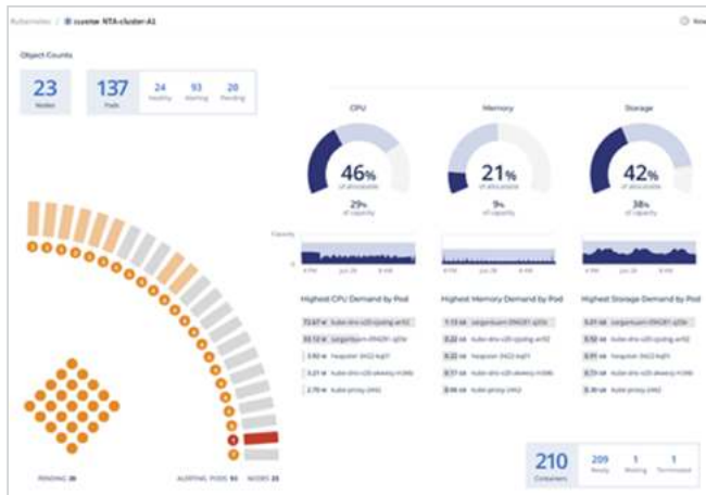
Kubernetes dashboard showing clusters and utilization

An extensive API allows integration into a wide variety of third party services and applications. From metadata integration with a CMDB to alerts to a wide variety of messaging and events management tools, and custom metrics from just about any application and service out there.